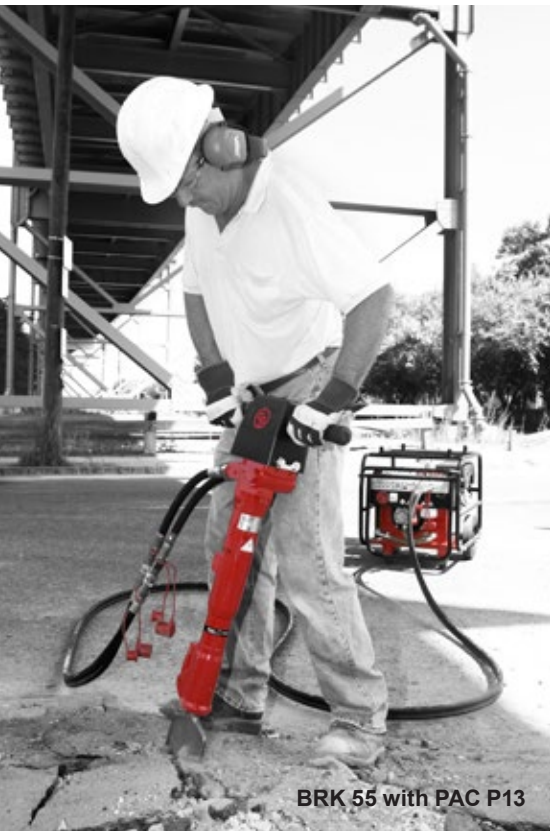
BRK 55 with PAC P13

CP hydraulic power packs are available in gasoline, diesel or electrically driven versions and are designed to provide portable power for a wide range of applications in the 20-40 l/min at 140-172 bar range.