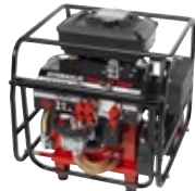
PAC P18 TWIN