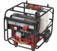
PAC E11 (Twin Not Pictured)